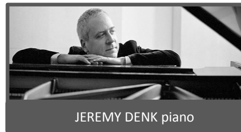
JEREMY DENK piano

Cocktails, Concert and Dinner – $780 (includes $485 donation) Pre-concert cocktail party, concert seating, post-concert dinner and valet parking. ($700 for NJSO patrons who have an October 7 concert ticket or will exchange for one)